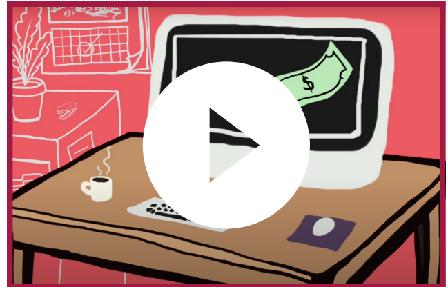
Source: Understand Goal 8: Decent Work and Economic Growth (Primary) https://www.youtube.com/watch?v=xcZamDv2DZQ