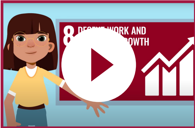
Source: Decent Work and Economic Growth SDG 8 Sustainable Development Goals for Kids https://www.youtube.com/watch?v=lj0JlrIWx2k